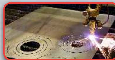
Cutting Tools Industry